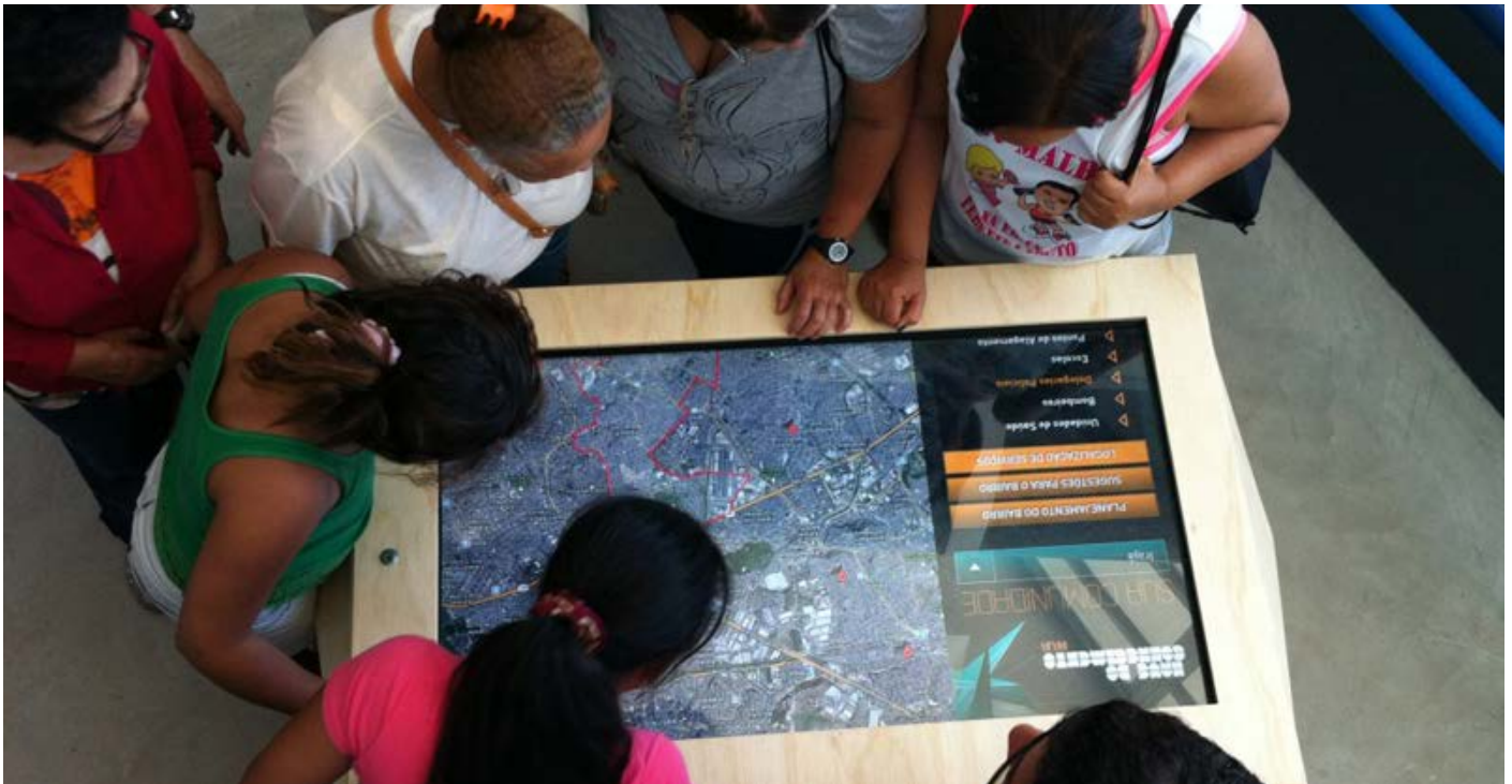
Knowledge Plaza, Brazil

the local government has supported the development of an innovation district across 1000 acres on the waterfront of South Boston. The mission of the district is to harness existing knowledge and create further opportunities for growth between enterprises and to foster collaboration, shared innovation and sustainable business practices. To facilitate this, a number of co-working spaces, innovation labs and apartments with work amenities have been developed. 'District Hall' is a building that anchors the district and serves as a central meeting ground between organisations. The hall has casual meeting lounges, 'flexible use pods', conference and workshop spaces. Since its inception, the Boston Innovation District has added over 5000 new jobs in more than 200 new companies across the city. Technology companies have contributed 30 per cent of new job growth, 21 per cent of which are in creative industries such as design and advertising, and 16 per cent in greentech and life sciences ( Boston's Innovation District 2015).