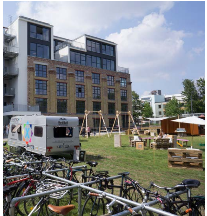
Factory , Berlin, Germany

Workspace configuration is not a one-size-fits-all game and must be attuned to employee needs and organisational policy if certain outcomes and capabilities