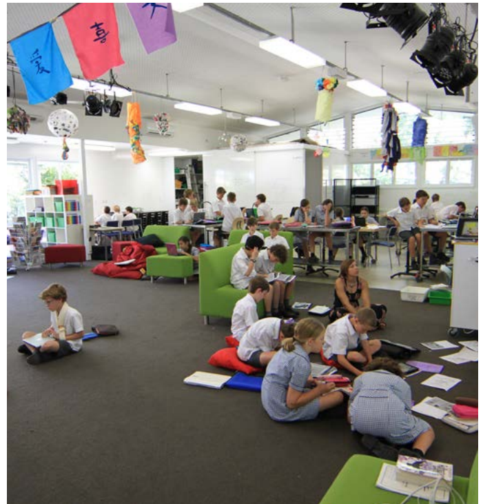
The Zone, Northern Beaches Christian School Sydney, Australia

Regrouping learners , by taking a 'stage-not-age' approach, in which learners are grouped by ability rather than age, recognises the individual student and their differing levels of ability and interests. Peer-to-peer learning is also better supported