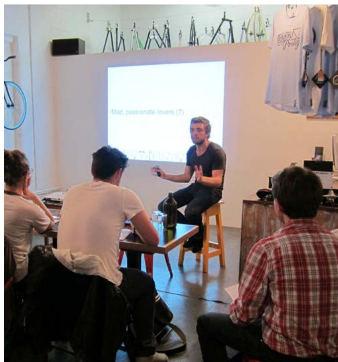
Laneway Learning, Sydney, Australia

In a career context, the continuing desire for lifelong learning and changing market expectations are requiring educational providers to think differently about how