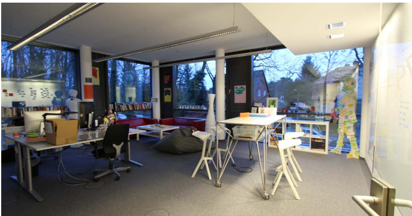
d.school, Berlin, Germany

Rescheduling learning refers to changing the structure of the school day, shifting from shorter periods of time on multiple subjects each day to fewer subjects over longer periods, enabling greater flexibility within lessons, and importantly, to enhance opportunities for deeper learning. This, in particular, is of benefit for schools that move away from a standard subject-based curriculum to interdisciplinary and project-based learning (PBL).