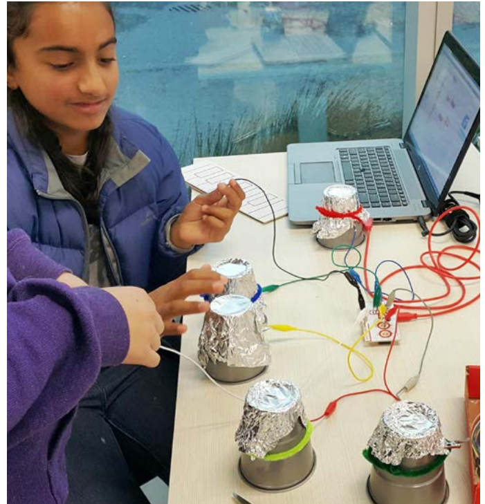
The Mind Lab by Unitec , New Zealand

The examples noted above demonstrate a shift from the traditional learning environment to a more disruptive innovation model (Leadbeater & Wong 2010). In formal contexts, i.e., within school, such as NBCS The Zone, Kunskapsskolan and High Tech High, timetables are personalised, assessment is less exam focused, classes are organised by ability and interest rather than age, and there is more collaboration through peer-to-peer teaching and learning. The interdisciplinary, project-based and authentic learning experiences offered by the d.school within Stanford University similarly depart from a traditional to a more disruptive approach to learning. In informal contexts, outside of school, spaces such as The Mind Lab by Unitec, are demonstrating the impact of independent enterprises that supplement learning offered within school, and which in turn are influencing school systems. Of note are the physical and spatial characteristics of all of these examples, which are less formal, more open and diverse, and as a result actively support collaborative work between students and their teachers.