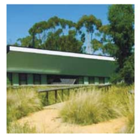
A view of the building from across the wetland which has been designed to filter storm water runoff from the site.