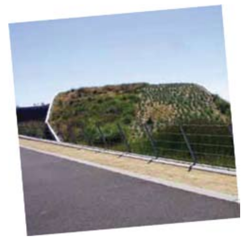
The native grass roof of MAFRI emerges from the wetland

The Marine Discovery Centre as well as DPI office space and laboratories are located within the building. The Marine Discovery Centre includes a visitors' aquarium, student laboratory, classroom and a resource room. Landscaping with indigenous