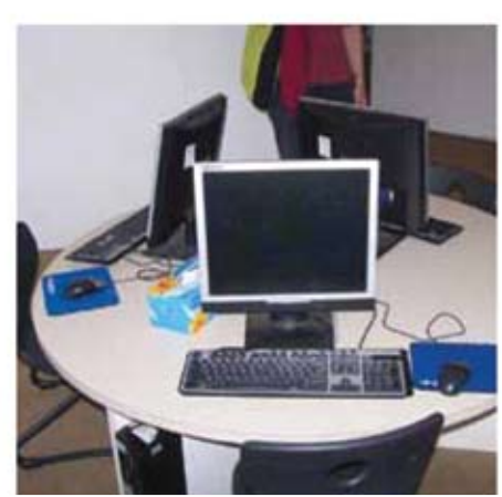
A classroom computer-pod – children face each other to facilitate interaction