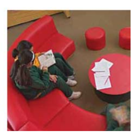
Children-sized soft furniture provides a comfortable reading and study space for students

Notable Melbourne designer, Mary Featherston, worked collaboratively with the staff and students to create a space that provokes creativity, exploration and expression in a variety of children and teacher friendly settings. The steel truss design of the building has allowed the designer to remove non-structural internal walls and open up spaces and rearrange the layout. The excellent natural lighting provided by the wall of windows and clerestory high lights has ensured that the space is bright, airy and filled with daylight. Mary Featherston and the faculty at Wooranna Park have drawn their inspiration for design from the theories of Howard Gardner and George Betts in the upper school and in the lower primary a major influence is the educational approach of the schools located in the northern Italian town of Reggio Emilia.