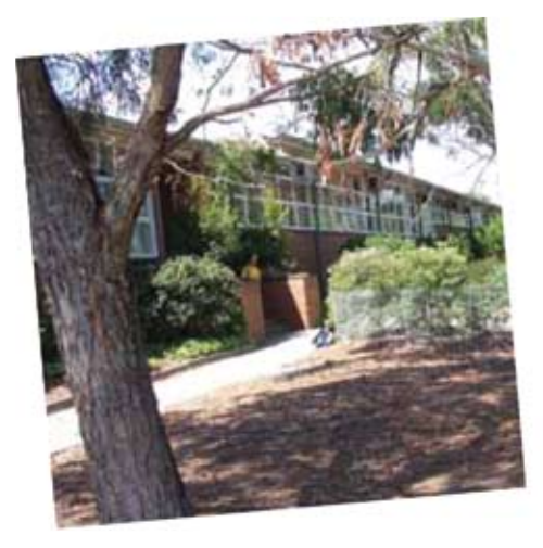
External appearances can be deceiving.