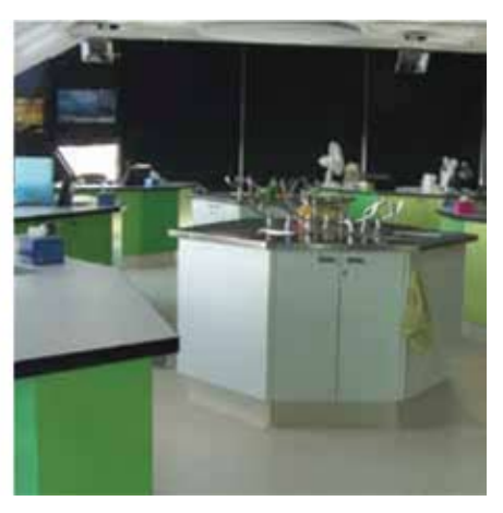
The bold colour scheme of the laboratory. The white ceiling reflects light to reduce the need for artificial light.