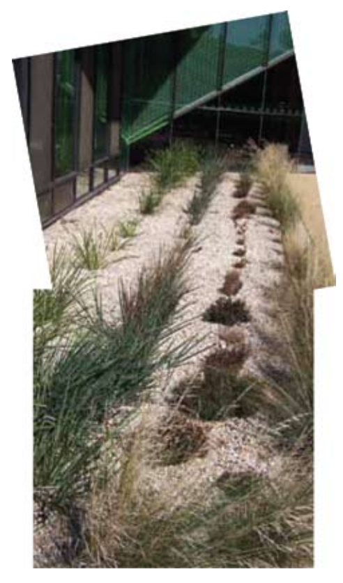
Low water use plantings at the main entrance. The bottom of the windows opens to draw in cool air.